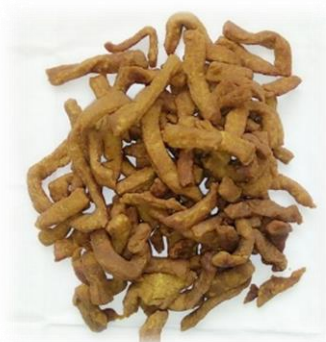
a. Snacks S10

Iron is present at 0.12 to 0.37% according to the investigations of Balogun and Akegbejo-Samsons (1992) in the different parts of the shrimp. It is reported to be the trace element present at the highest concentration (0.005%) in shrimp head autolysate meals following the investigations of Guo et al. (2019) while it occurs at 0.08% in shrimp head meals according to Fernandes et al. (2013). Iron is found at 0.006% in shrimp heads studied by Cao et al. (2009) and its content decreased to 0.0014% in autolysates. Iron could not be detected in SSHA probably due to its presence at very low dose.