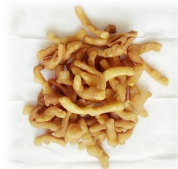
b. Snacks S5