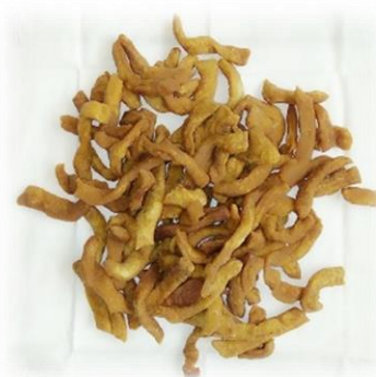
c. Snacks SL