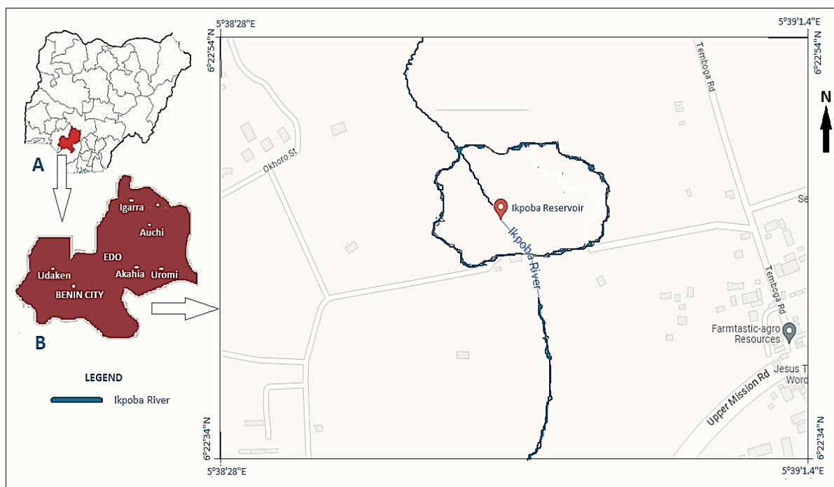
Figure 1. Sectional map of Benin City showing Ikpoba reservoir and sampling Stations. Inset maps: (A) Nigeria (B) Edo State.

In the laboratory, fish samples were thoroughly washed with distilled water and drained under folds of filter paper. The fish samples were dissected and fish fillets were collected along the lateral line. The fillet samples were homogenised and subsamples of the homogenate were taken for respective nutritional composition analysis. The analytical methods used for